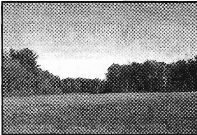
Over 200 years of Family Landowner Management