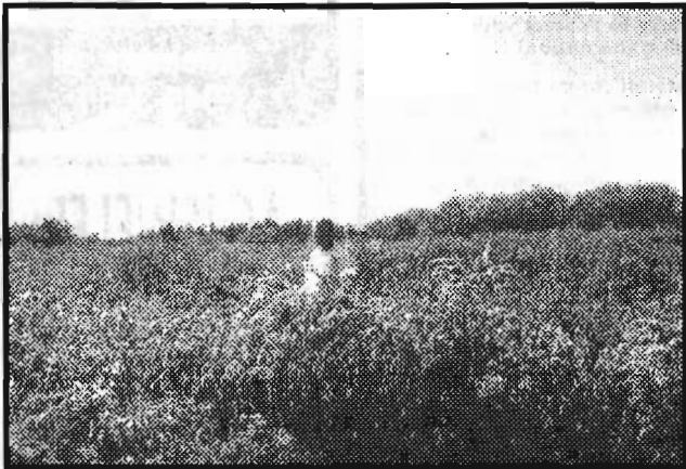
This is what 20 years of Land Trust Mismanagement has done to a green hayfield