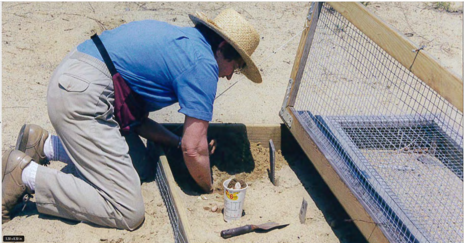
5.50 x 8.50 in